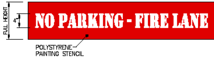
FIRE LANE MARKING DETAIL NO SCALE

FULL HEIGHT OF FACE OF CURB. FIRE LANE MARKING LEGEND AT 25' OC, SEE DETAIL ABOVE.